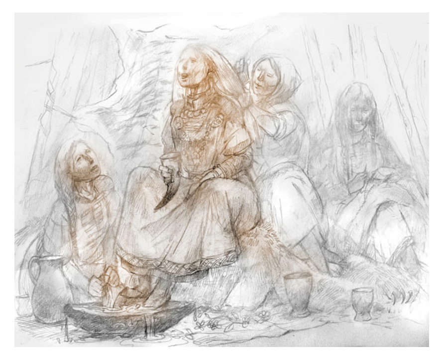
Figure 2. 'Then they appointed two young slave girls to watch over her and follow her everywhere she went, sometimes even washing her feet with their own hands ... Meanwhile, the slave girl spends each day drinking and singing, happily and joyfully.' (Lunde & Stone 2012, 50). The Angel of Death prepares the dead man's funerary clothes while her 'daughters' tend to The Girl Who Wishes to Die. (Illustration: Eric Carlson. © KHM.)

social anthropology's interminable male gaze. If we only ask part of the population how their gender dynamics work, we can hardly expect to achieve a full picture (Moen 2019a, 41–2; Pyburn 2004). Nor does the silence of a social actor in some settings mean that they have no voice or choice of how to use it. We should consider if scholarly voices subsequently have promoted this passivity rather than examining their potential for otherwise obfuscated agency.