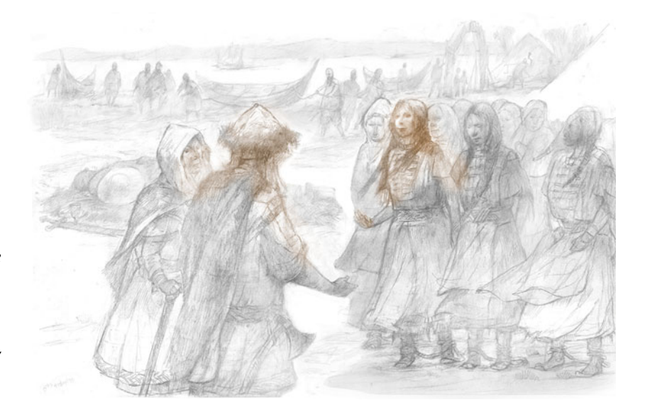
Figure 1. 'When a great man dies, the members of his family say to his slave girls and young slave boys: "Which of you will die with him?" One of them replies: "I will".' (Lunde & Stone 2012, 50). The slave girl volunteers to die. (Illustration: Eric Carlson.)

overall influence of Ibn Fadlan's account and its subsequent academic treatment, rather than on the veracity of it.