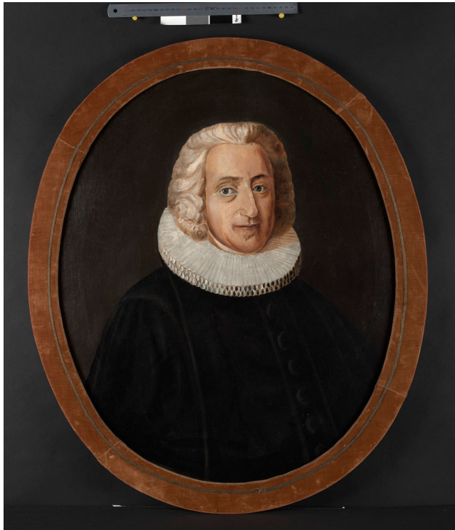
Hans Poulsson Egede.

historian in Greenland. The small, remote colony in Greenland was an atypical site of alchemy. This article addresses the hindrances that Egede met with in such a site, and brings to light those aspects of his situation in the colony that may have facilitated his alchemical practice.