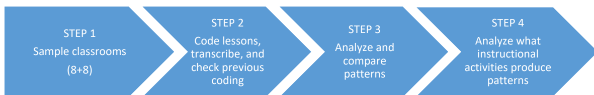
Figure 3. Analytical procedure in Article I.

Analyzing instructional patterns with PLATO. For the analyses in Article I, I focused on six elements of the PLATO observation system: the classroom discourse elements Uptake of student responses and Opportunity for student talk , and the presentation of content elements Quality of instructional explanation , Richness of instructional explanations , Connections to prior knowledge , and Purpose (see Appendix 1) to capture and compare instructional quality across Helsinki and Oslo classrooms. I focused on these aspects of instructional quality because, in initial PLATO coding of all 12 elements, they showed the biggest differences across elements and contexts, and because, based on previous research, they suggested possible differences across contexts. In the following, I will describe the analytical procedure in Article I (see Figure 3).