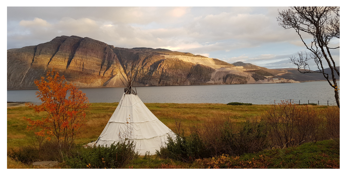
Fig. 1. View of the Giemaš from road 890, across the sound. The quartz quarry is clearly visible on the mountain slope descending on the right.