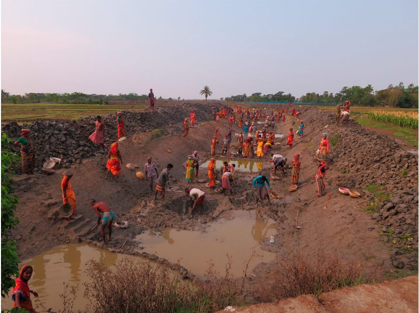
Figure 2. Canal excavation in 'Nodi', May 2015.

activities to implement (World Food Programme 2012). Whether climate change adaptation projects can benefit or local populations or not depends on how climate change adaptation is translated in the shaping of a particular development intervention, which itself depends on the constitutions of donors and their implementing partners in specific development assemblages.