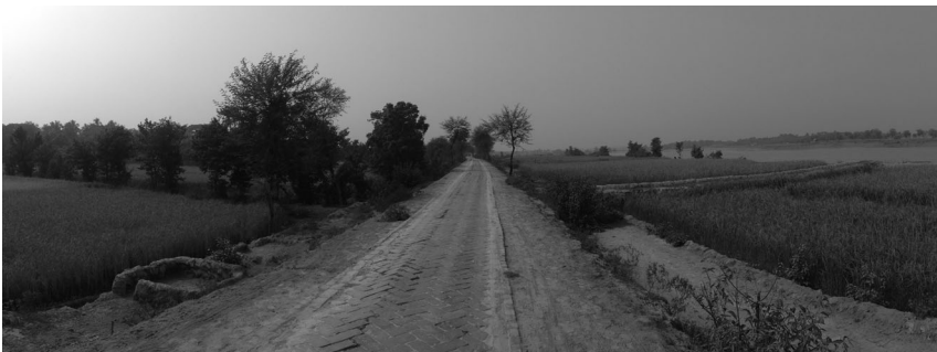
Figure 1. The Embankment of Nodi, raised riverbed to the right, embanked floodplain to the left. Source: Author, November 2012.