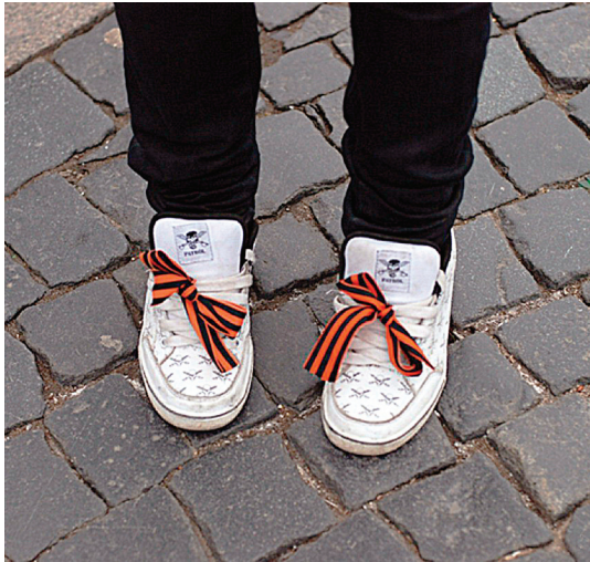
Fig. 9. Trainers.

However, not only business but also ordinary people contributed to the trivialization of the St George action, at least in the opinion of some of the purists. While the ribbon was originally supposed to be pinned onto the lapel, it soon turned up on suitcase handles and children's prams, as well as on cars, not only tied to antenna or inside the front window, but also on license plates. Some 'concerned citizens', particularly of the older generation, perceived impudence when they saw the ribbon used as shoe laces, as body art, around dogs' necks, or attached in abundance all over the body (see figs 9 and 10). 66