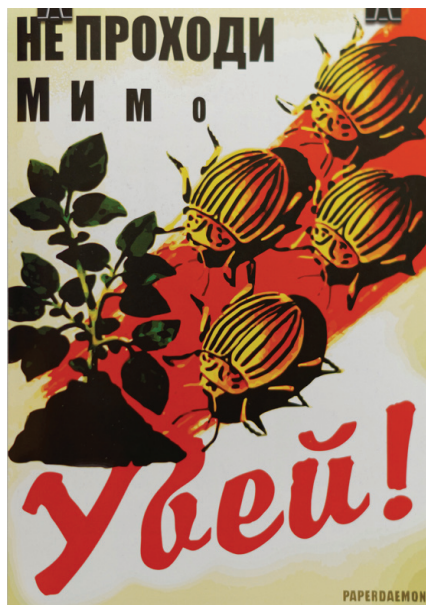
Fig. 19.

Just as the real Colorado beetles should be ruthlessly exterminated, no mercy ought to be shown towards the human kolorady (fig. 19).