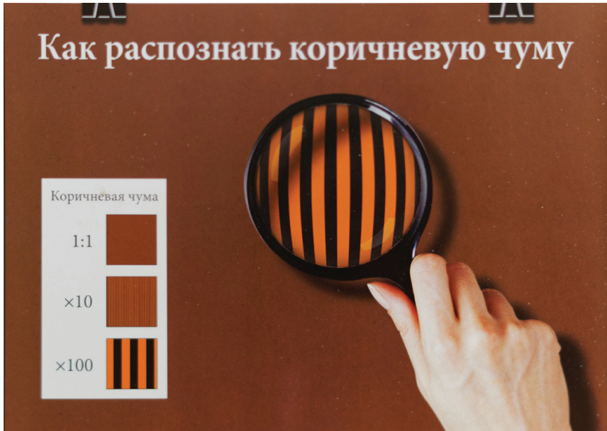
Fig. 18. 'How to recognize the brown plague.'

a pro-Russian rally in Kharkiv in May 2014, claimed that the demonstrators carried 'Nazi symbols'. To substantiate this startling piece of news, it explained that the demonstrators 'held in their hands the orange-black flag, which was used by General Vlasov's Russian Liberation Army when fighting on the side of Hitler during the Second World War'. 103