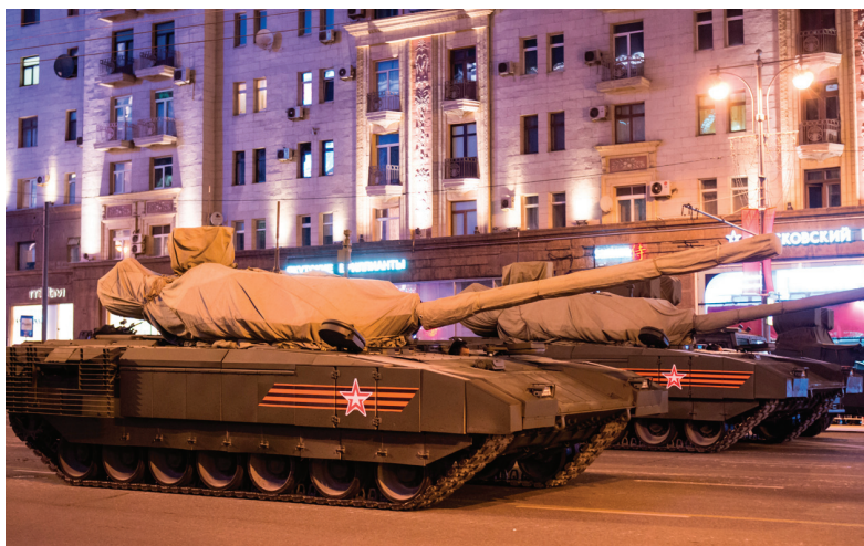
Fig. 11. Decorated tanks. Rehearsal of the Victory Day parade at Tverskaia street, Moscow, with new Russian military vehicles.

The link between the authorities and the ribbon of St George is more than a matter of the regime lending a helping hand in the action. Tanks and other military vehicles adorned with orange and black stripes symbolize the military power of the contemporary Russian state just as much or more than they commemorate the war (see fig. 11).