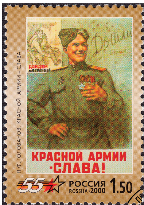
Fig. 3. 'Krasnoi armii – slava!', by L. F. Golovanov. 1 ruble 50 Russian postage stamp, 2000.