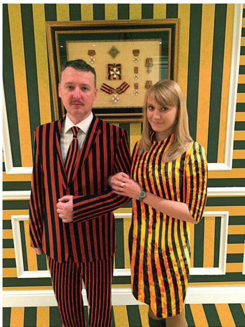
Fig. 15. Galereia S.ART. All rights reserved.