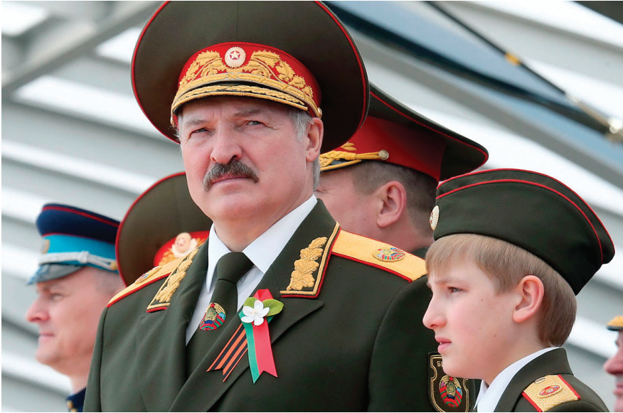
Fig. 20. Lukashenko with his youngest son, Nikolai, Minsk 2015.

black, while the other half was the new red and green Belarusian ribbon, replete with the apple flower (fig. 20). 144 This episode graphically illustrated how sensitive the symbol issue has become in Russia's relations with other CIS countries, and how important it is for state leaders in neighbouring countries not to make any false steps.