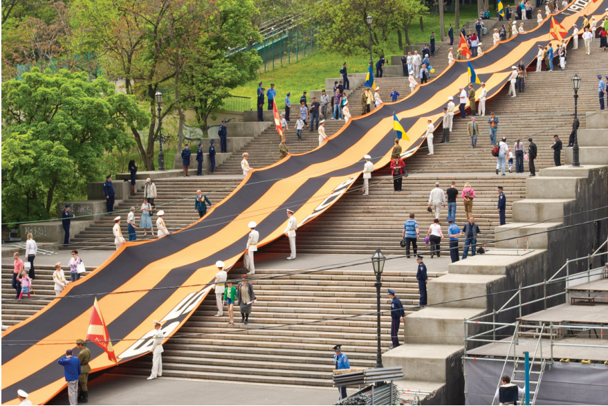
Fig. 7. A huge ribbon of St. George is presented on the Potemkin Steps for the Victory day May 8, 2010 in Odessa, Ukraine.

Activist groups in several cities have produced supersized ribbons, aimed at getting into the Guinness Book of Records : a 3.5 x 50 m specimen made of one seamless piece of cloth was produced in Simferopol in Crimea in 2009, 46 but this record was surpassed the next year in Odessa when a 6 x 142 m ribbon was carried down the famous Potemkin steps by 12,000 people (see fig. 7). 47