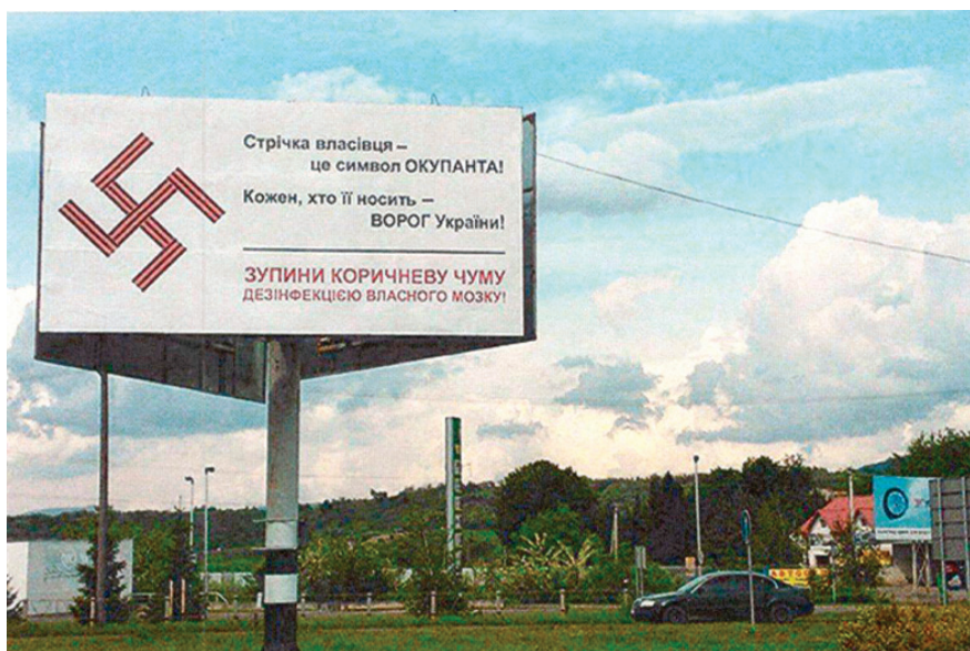
Fig. 17. ‘The Vlasovite ribbon is a symbol of the occupier. Everyone who carries it is an enemy of Ukraine.’