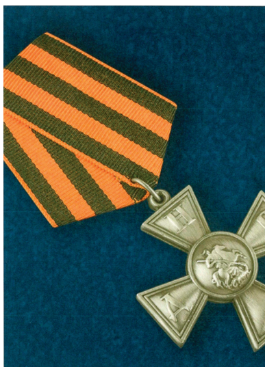
Fig. 16.