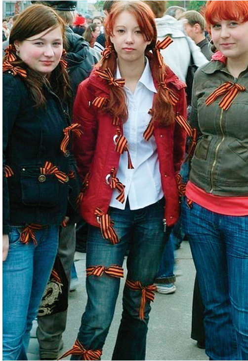
Fig. 10.

the St George action into ‘a mass psychosis’. 69 Again, it was difficult to draw the line between playful creativity on the one hand, and disrespect on the other.