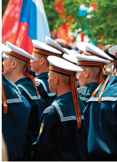
Fig. 14. Celebrating the 69th anniversary of the Victory Day and 70th anniversary of Sevastopol liberation from fascists. Sevastopol 2014. Seamen.

Ever since the ‘little green men’ took over the peninsula, posters and billboards decorated in orange and black stripes have cropped up in towns and hamlets throughout this new Russian Federation subject. The ribbon of St George has become an emblem of Russian triumphalism. 97 In the self-proclaimed Donetsk and Lugansk People’s Republics, it is the main banner, featured in abundance on official websites. Symptomatically, ‘the hero of Sloviansk’, Igor Strelkov-Girkin, and his girlfriend are shown on the Internet in outfits made of rather garish orange and black-striped material (fig. 15). 98 The Donetsk People’s Republic has also instituted an order of valour for militiamen who have distinguished themselves in the ongoing war (fig. 16). 99