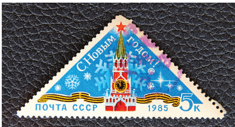
Fig. 2. New Year stamp showing the Moscow Kremlin, USSR, 1985.