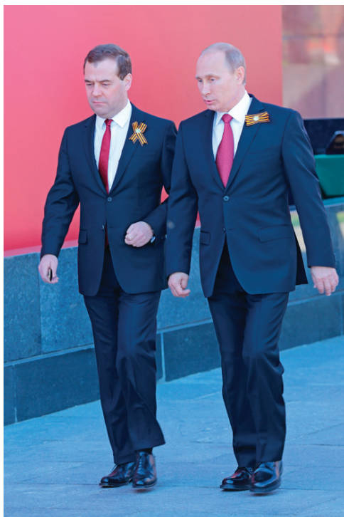
Fig. 6. Dmitrii Medvedev (left) and Vladimir Putin (right), Moscow, Russia – May 09, 2014: Celebration of the 69th anniversary of the Victory Day (WWII) on Red Square.

From a relatively modest start, the campaign has grown in size and significance. While 800,000 ribbons were manufactured in 2005 43 and six million in 2006, by 2010 six million were not enough to meet demand even in Moscow city alone. It became necessary to introduce restrictions on how many ribbons each individual could pick up at the distribution points: a limit of three was imposed. 44 Various sponsors — commercial and official — financed the production of the ribbons that were sewn at textile factories all around the country. In 2015 one textile mill in Kazan' alone rolled out no less than 10,000 km of ribbon. 45