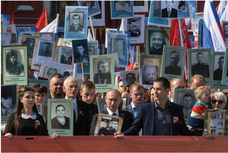
Fig. 13. Russian President Vladimir Putin (centre) holds a portrait of his father as he takes part in the Immortal Regiment march during the Victory Day celebrations in Moscow on May 9, 2015.

concerns that the All-Russian Popular Front, a ‘GONGO’ 94 established in 2011 at the behest of Putin himself, was trying to take their organization under its umbrella and indeed to control it. 95