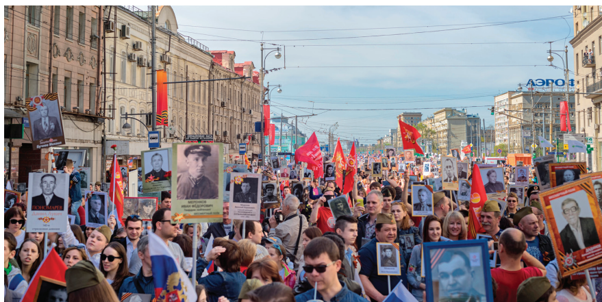
Fig. 12. Immortal Regiment marches on. Moscow celebrates 70th Victory Day anniversary on May 9, 2015.

12 million people participated in 120 different Russian towns and cities, in addition to marches organized abroad. 86 A few critical voices denounced the march as ‘a cynical, coarse propaganda parade’, 87 and a week after the March a number of photos were published on the internet, showing heaps of discarded Regiment placards near public garbage cans. Allegedly, this showed that participants in the marches had been paid to carry portraits of people they did not know and did not care about, and therefore disposed of the placards unceremoniously as soon as the march was finished. On the other hand, Oleg Lur’ë, a former journalist of Novaia Gazeta , speculated that the photos were fake and the entire story a hoax, intended to discredit the Regiment. The placards, he believed, had probably been produced after the march by the same people who posted the photos on the internet. 88 In some cases, however, the explanation turned out to be rather mundane: some local organizers of the Immortal Regiment marches had with the best intentions produced placards of veterans who had no surviving relatives and handed them out to people who wanted to participate in the march but