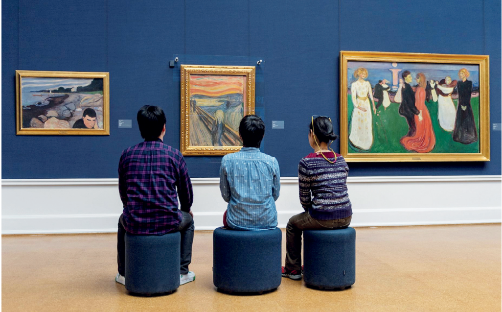
Fig. 1. Wall texts from permanent exhibition 'Dance of Life' (2010-2018) at the National Museum of Art, Architecture and Design, Oslo.

with works from the design and decorative arts collections shown on the first floor (31 rooms) and the second floor showing works from the art collection, interspersed with works from the architecture collection (56 rooms). The overall chronological approach to an historical narrative thus differs from the previous exhibition in the National Gallery building in its emphasis on interdisciplinary interplay between art forms from the same time period – and occasionally across periods – to illustrate a particular theme or motive (Nasjonalmuseet 2016).