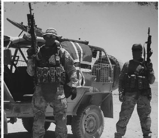
Figure 1. From upper left to lower right corner: Thích Quảng-Dức (1963); the French Revolution (1789–1792); the Tollund Man bog body (fourth century BC); foreign fighters (2015) (photographs from Wikimedia commons).