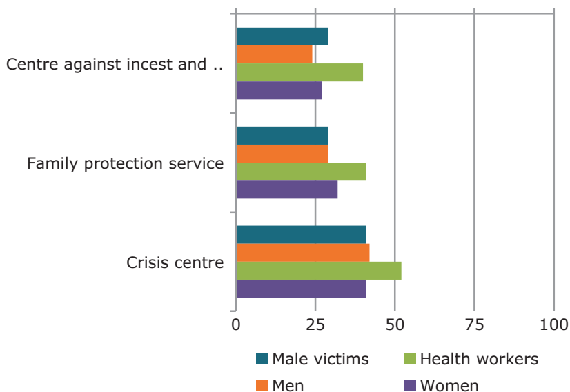
Fig. 3.2 Percentage of those aware of the services available to men subjected to violence in intimate relationships

handle it” on their own. Among those who have not sought help, over 60 per cent give this as their reason. A larger proportion of those who have been subjected to physical violence express that they would rather deal with it on their own (62 per cent) than those subjected to psychological violence (48 per cent). Many men responded that they do not generally seek help when they have problems and/or that they experience it as shameful to do so. Other respondents indicated that they feared the potential reaction of their partner or further abuse.