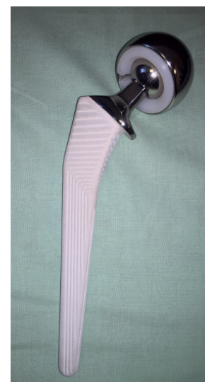
Figure 1. Hemiarthroplasty: Corail stem with bipolar head.

Power calculations were based on previous studies on bone remodeling around the femoral stem (Boe et al. 2011b, Merle et al. 2012, Salemyr et al. 2015). We estimated a clinically