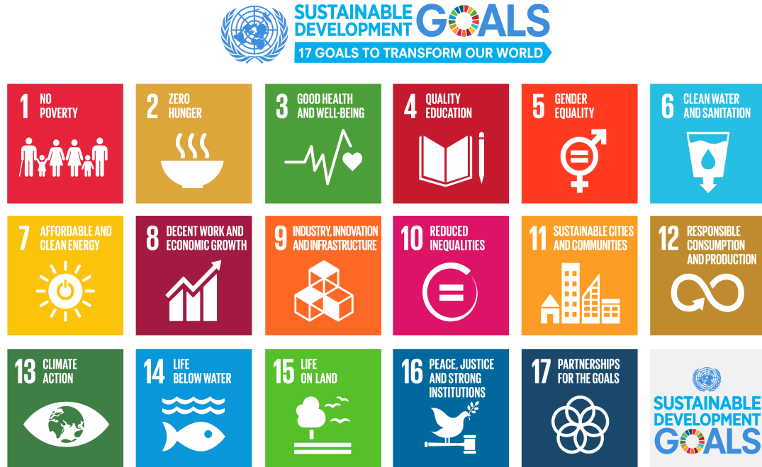
Fig. 1. United Nations Sustainable Development Goals

“Transforming our world: the 2030 Agenda for Sustainable Development” is the United Nations agenda for sustainable development. Adopted in 2015 by the UN General Assembly, it consists of a Declaration and a set of Sustainable Development Goals (SDGs). The Declaration refers to the contribution of ICT to sustainable development: “The spread of information and communications technology and global interconnectedness has great potential to accelerate human progress, to bridge the digital divide and to develop knowledge societies [...]” [13].