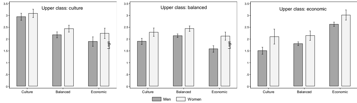
Figure 3: Logit coefficients with 95% confidence intervals for men and women with origins from the three upper class fractions in comparison to men and women with origins in the unskilled working class. The outcome variable measures position in either i) the cultural fraction of the upper class, ii) the balanced fraction of the upper class, iii) the economic fraction of the upper class, controlling for time period.