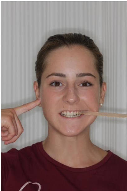
Figure 6. The dental stick test.

Purpose: Pain provocation; to reproduce pain from the intra- or the extra articular structures.