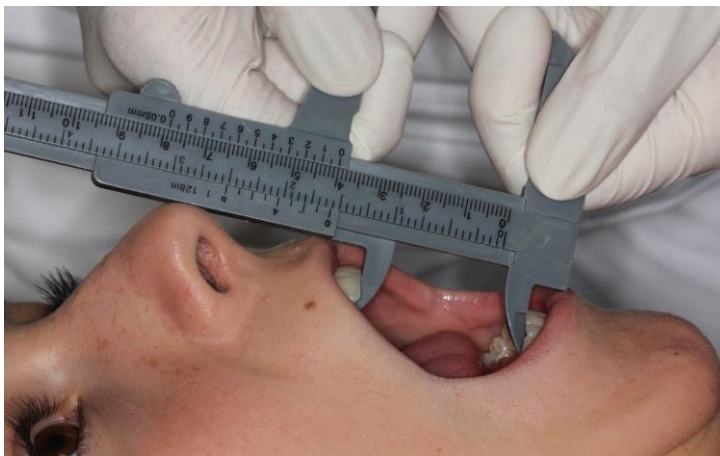
Figure 2.1 Mouth-opening.

Purpose: To measure the participant’s ability to open the mouth; the range of motion is measured in mm.