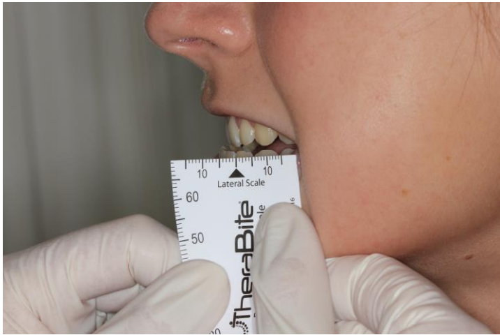
Figure 2.2 Protrusion.

Purpose: To measure the participant's ability to move the mandible anteriorly.