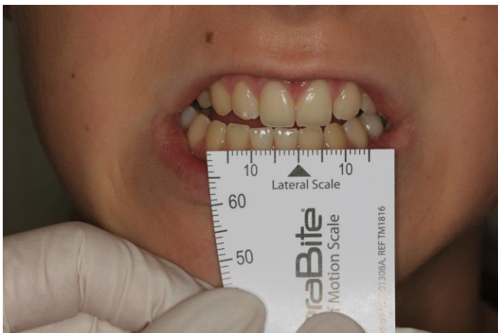
Figure 2.3 Laterotrusion.

Interpretation of the test: A limited protrusion on either side is defined as \leq 7 mm.