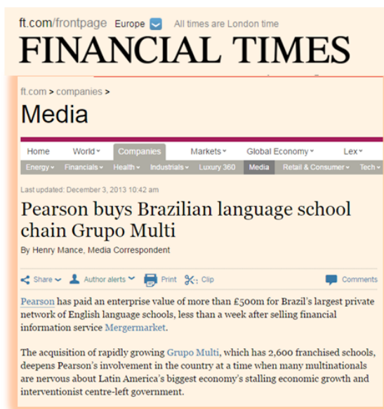
Figure 7. Financial Times article about Pearson’s actions in Brazil.

PISA itself is also widening its repertoire. With a new product, the “ PISA-based Test for Schools ”, individual schools or school districts may get “ information and analyses [...] comparable to existing PISA scales. ” ( http://www.oecd.org/pisa/aboutpisa/pisa-basedtestforschools.htm , accessed 13 March 2017). This, of course, may create an enormous market, and also bring competition, testing and rankings even closer to the daily activities in schools. The PISA influence on local education policy will also be stronger. The PISA-based test for schools is a commercial product.