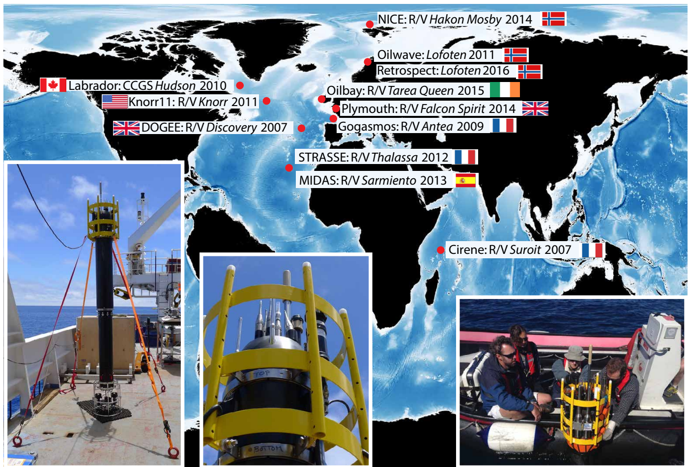
FIGURE 1. World map showing the locations of Air-Sea Interaction Profiler (ASIP) deployments, their years, and the research vessels. Insert from left to right: ASIP on the deck of R/V Thalassa , a close-up of the top section of the profiler with the sensors surrounded by a guard, and the deployment of ASIP from a small workboat in Plymouth Sound in May 2014.