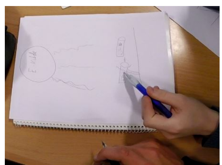
Figure 4. The students working on their joint drawing of the greenhouse effect

In this case, the containers used were not open beakers, but plastic bottles. One bottle contained ordinary air and the other a larger percentage of carbon dioxide. The same working lamp as in Case 1 was used, and a black sheet of paper was positioned behind the bottles, functioning as the earth's surface. In Excerpt 2, the four students Chris, Lea, Siri and William (pseudonyms) are sketching a joint drawing, with Chris as the main author. They struggle with how to explain the roles that the absorption and reflection of radiation play in the greenhouse effect and how to demonstrate it in their drawing. In the drawing, they have already drawn an energy source, radiation from the energy source, two bottles with different gaseous content and a black sheet behind the bottles (see Figure 4).