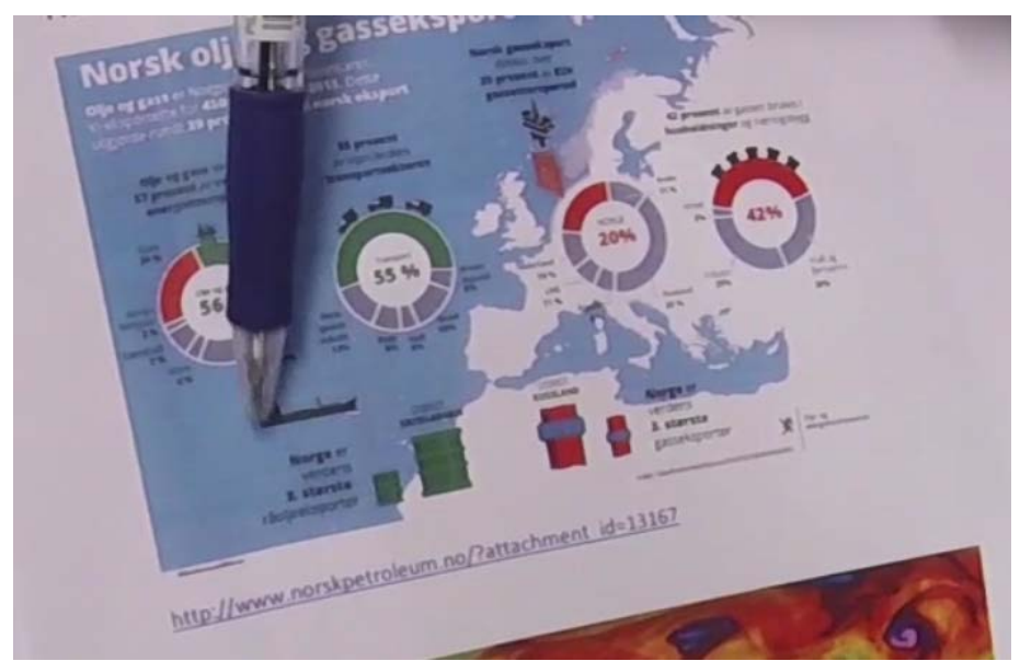
Figure 5. The diagram that the students selected for their SSI argumentation

In Excerpt 3, the students' focus of interest is different from those of the first two cases. The excerpt exemplifies the challenges that the students faced when trying to find and interpret representations to support their argument. The representation, which consists of a cluster of modes, was first judged as being useful by Ben (Turn 2), and then Tim subjected it to a more detailed interpretive investigation to find out what it means (Turn 3). Tim reported his interpretation of the representation and its affordances to the others in Turn 8. The students opened up two problem areas: what the representation means (Turns 5 and 8) and how it can support their assigned argument (Turn 9). Apart from this, the excerpt also shows that the students were aware of the need to produce a text (Turns 4–6). Although the representation did not afford much access to science content, it offered factual backing of the students' argument. Looking at this discussion in terms of opening up a third space shows that this space included not only the negotiation and expression of a scientific interpretation, it also included the use of the representation as an authoritative premise in the students' argumentation.