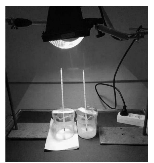
Figure 1. The experimental setup

working lamp was shining onto both beakers, and thermometers were used to indicate the temperature inside them. The students were allowed to use their textbooks and computers as resources (see design principles 5 and 6 for the learning of science content). When the students had completed their drawings, the teacher told them to form new groups consisting of two previous groups. Each new group of four students was then supposed to sketch a new drawing based on those that each of the two constituent student groups had previously drawn.