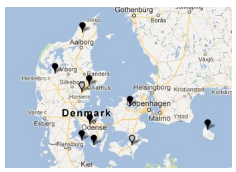
Map 3: Present tense HAVE + present tense stative verb (bo 'live') with conjunction in Danish. (#527: Jeg har en moster og bor i København. 'I have an aunt living in Copenhagen.') (White = high score, grey = medium score, black = low score).