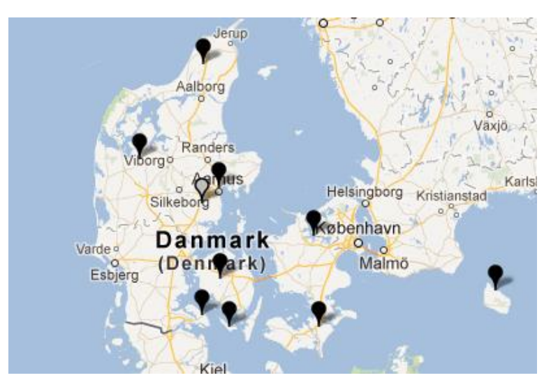
Map 4: Present tense BE + present tense of eventive verb with conjunction in Danish. (#561: Der er en hund og gør hele tiden. 'There is a dog barking all the time.') (White = high score, grey = medium score, black = low score).