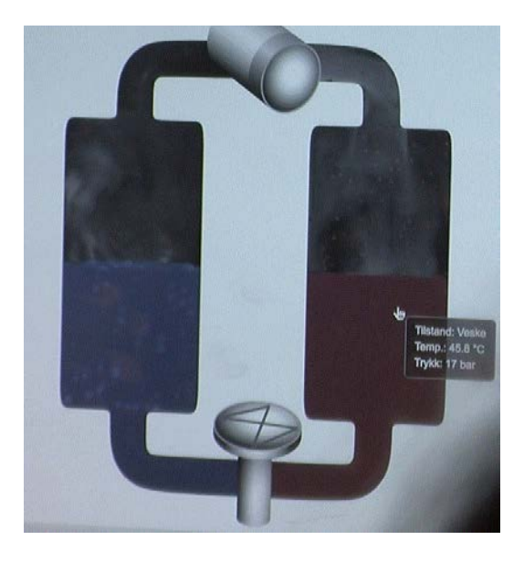
Figure 1. Model 1, which is an animation of the process of phase transition.

In the first few lines of the excerpt above, the students agreed that the temperature was quite low in the bottom part of the animation. In lines 5-6, Ingrid said the temperature increased, an inference based on the representation of steam on the upper left side of the model. Allan drew an analogy between the syringe and the left part of the figure. This is partly correct. Similarly to the syringe and because of the valve, the pressure decreases in the left chamber, and the liquid starts to boil. Allan and Ingrid agreed in lines 12–15 that pressure was a relevant concept. In line 12, Allan oriented them to the right side of the representation, pointing out that the pressure was higher. They grounded their interpretation in the textual description of the pressure, which states 17 bar (Figure 1). Thus the concept of pressure was made relevant by the model. The abstract concept became something else – something they could make sense of because of the sign. The model mediated a new understanding emerging in the system, namely that pressure is not static but a dynamic phenomenon, and that this is relevant to the explanation. Through this, Allan was also able to introduce the three laws as relevant concepts in the functional system.