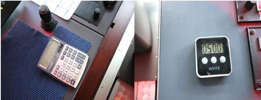
Figure 2. Calculator (left) and alarm clock (right).

Two deck crewmembers walk on deck and open the valve of the container on the left side of the vessel. Then Operator 1 records all information on the checklist that the first officer gave him. Next, Operator 1 calculates roughly how much mud he needs to move to container six (see Figure 2). When he finishes his calculation, he fills out a paper form and delivers it to the first officer to sign.