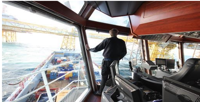
Figure 3. First officer looking outside to help the dynamic positioning operator position the vessel under the middle of the crane on the platform.

In analyzing the dynamic positioning operation described above, we found that some information that operators want or need was hard to read from the display. This included how much water should be piped out and how much mud should be moved to balance the vessel. We confirmed this finding in an interview with operators. This example illustrates that when the operator experiences some deficiencies in the hardware and software, it may reflect the fact that it was tested before its assembly on the ship bridge and operators were trained a few times with simulators. Usability testing could also have been conducted after the dynamic positioning subsystem was developed. However, operators adjust their behavior when they use it in actual operation.