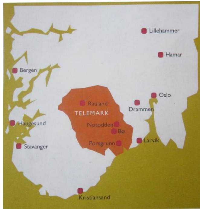
Figure 3: The Telemark region and the location of TUC