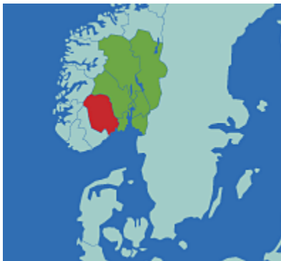
Figure 2: The Telemark region in relation to other regions of Norway