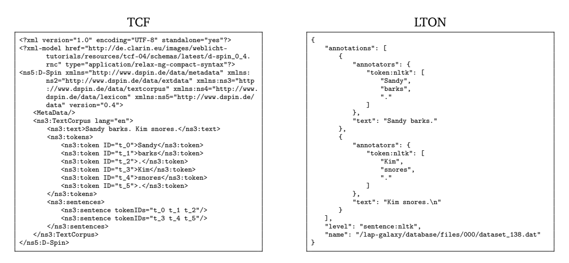
Figure 3: An example of a toy corpus annotated with sentences and tokens, formatted in the two candidate interchange formats for LAP.

wrapper handles the submission of the job to the Abel cluster.