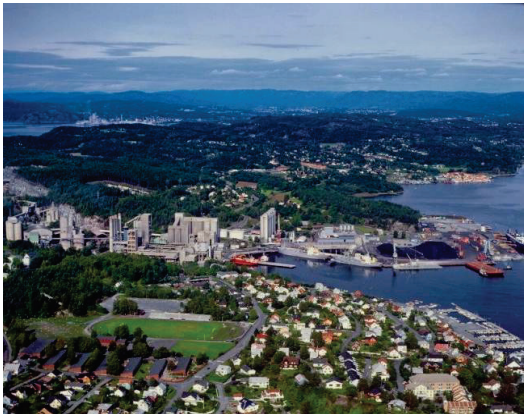
Photo of the Brevik plant.