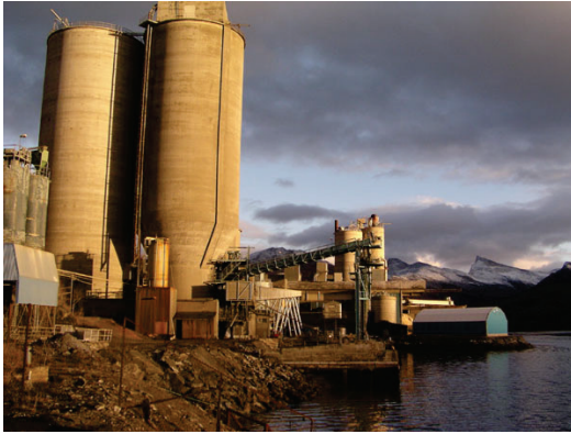
Photo of the Kjøpsvik plant.