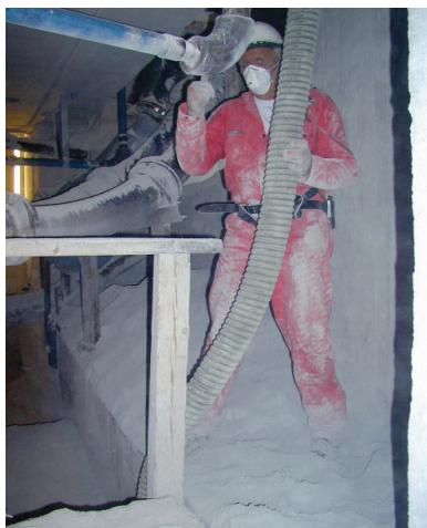
Photo. Removal of cement production dust.

Inaccuracies in the estimation of exposure tend to mask any exposure–response relationships present. This could have been the case in studies I, II, and III. The methods used to estimate exposure varied throughout the period in which the present studies were performed. Improved exposure estimates, in addition to the improvement of their validity and power in study IV, were probably necessary to allow the detection of associations between outcomes and exposure in workers exposed to levels of cement production dust below the Norwegian OEL (respirable dust, 5 mg/m 3 ; total dust, 10 mg/m 3 ).