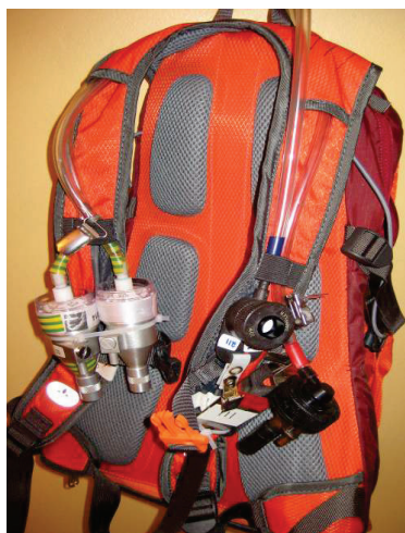
Photo. Exposure measurement equipment used in study III.

The contemporary cement dust levels were also measured to compare them with the dust levels reported in former studies. Personal dust samples were collected over 8 h on three days of work. Asbestos exposure was considered a possible confounding factor, and the exposure weighting technique described above for cement dust exposure was used to estimate individual asbestos exposure. The level of \alpha -quartz was measured in one of every three of the worst-case personal dust samples that were collected in the area where quartz is added to the raw material.