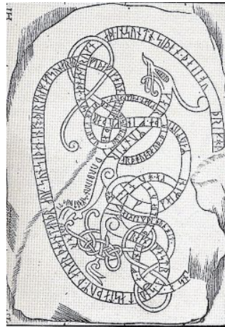
Figure 6: the Hillersjö runestone

In this case Geirlaug, after a series of marriages and deaths, inherits from her only surviving daughter Inga, whom she outlives. The runestone recording this complex inheritance pattern was placed in full view for everyone to see, so that the claim to the property could not be doubted or contested. From this inscription we learn that women did not inherit from their husbands if they had children, but they inherited from their children if these died before them. We also learn that women as well as men had the right to inherit, whereas in many other countries property would pass to the closest male relative once a couple's male children were dead. Furthermore we are aware of the fact that a woman alone, such as Geirlaug, was able to administer property and run wealthy farmsteads by herself, without becoming subjected to another man, such as a more distant relative. Women therefore had legal rights and were regarded as people just like men were. They were not entirely subjected to men, but retained a degree of legal and economic freedom. Widows especially, could become very prominent figures in society.