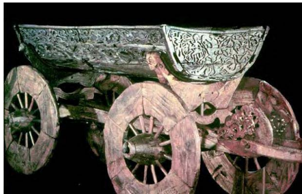
Figure 3: the Oseberg wagon

Among the grave goods were also a wagon and 3 large sledges which are very interesting. The wagon is a very old Iron Age type, of which we have parallels in Denmark and on the continent. It has been dated to the 8 th century. What mostly distinguishes this wagon is its decoration. All four sides of the wagon are richly ornamented with legendary scenes. At the back of the wagon nine cat-like figures holding a paw in front of an eye are represented. The legendary scenes are hard to identify, but one is possibly a representation of Gunnar in the snake pit, as told in Atlakviða in the Poetic Edda . 84 Male heads and snakes are frequently represented among the carved scenes and these depictions are thought to be protective symbols. 85 Some scholars, such as Ingstad, argue that the wagon was only used for ceremonies and processions, as it is so vastly decorated. I believe that the wood carvings indicate that the wagon was the means of transport of a high status person, which could be used both for practical and ceremonial functions, as the decorations do not compromise the functionality of the vehicle.