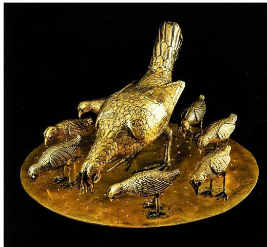
Figure 10: the hen and chicks of Teodolinda

An interesting consideration emerges when comparing the Oseberg burial to that of Queen Teodolinda. Both burials contained items which are not easily interpreted. In Oseberg we have the wooden staff, the highly decorated wagon, the five animal headposts and the iron rattles, which have all been attributed a cultic significance, but for which we do not know the exact use or meaning. In Teodolinda’s burial we have the spearhead, the male tooth and, especially, the golden hen with its seven golden chicks.