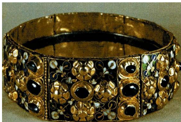
Figure 8: the "corona ferrea"

The sarcophagus of Teodolinda was first opened in 1941. In it were found various objects, including some nails, a selection of golden decorative elements which were probably sewn onto leather, a decoration from the scabbard of a knife and an iron spear head. The finding of a male tooth in the sepulchre led to the hypothesis that Teodolinda's son Adaloaldo had also originally been buried with her. It is thought that the votive crown, the golden gospel cover and the mysterious gold hen and chicks which form part of the treasures of Monza were also originally part of the grave goods of the queen and were removed from her tomb when she was moved into the sarcophagus in 1308, 186 the year in which the church was rebuilt. Also attributed to her is the so called corona ferrea , a crown said to be made from one of the nails by which Jesus was put on the cross.