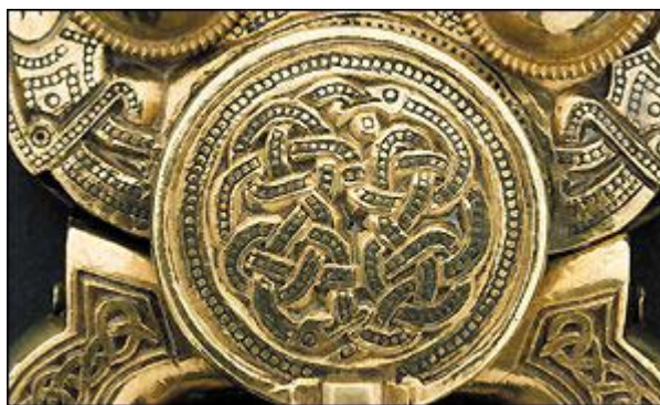
Figure 7: the Sutton Hoo gold buckle

boss and other metal parts of a decorated shield. A sceptre, modelled as a large whetstone and surmounted by a model stag, is probably a symbol of royalty. More gold is to be found on the purse lid's decorative plates made of garnet cloisonné and millefiori glass, and on the similarly decorated shoulder clasps and sword belt buckle. A further buckle, made entirely of gold and decorated with animal figures, of the weight of 412.7g 175 was also found in the grave. Finally 37 gold coins, 3 blank coins and 2 ingots which were probably inside the decayed purse were discovered. The objects are mostly of Anglo-Saxon or Scandinavian manufacture, whilst the coins are Frankish. All these items date to the early 7 th century. A further set of interesting objects is the three silver bowls with silver spoons of byzantine origin which also formed part of the grave goods. A large bronze Celtic hanging bowl, dated to the late 6 th - early 7 th century completes the picture of the valuable items found in the ship mound of Sutton Hoo. 176