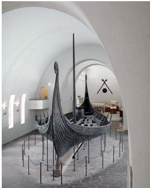
Figure 2: the Oseberg ship

One of the first elements to be noted when observing the ship is its decoration. The stem and stern of the ship, together with some associated timbers, are covered in carvings of animal art style. Based on experimental archaeology, it has been argued that it took about a year to complete the carvings 59 . As we have seen, Ingstad takes the carvings as an indication of cultic use, but she does not relate them specifically to a cult like she does for those on the wagon and sledges. Carvings are also found on other ships and boats, such as on the Nydam and Kvalsund boats. 60 There is also evidence that the Gokstad ship was decorated, although this was in the form of painting rather than carving. The use of carving or painting on a number of vessels could indicate that it was a common practice in the Viking Age to decorate a high-status vessel, and not necessarily that the vessel was used for ceremonial purposes.