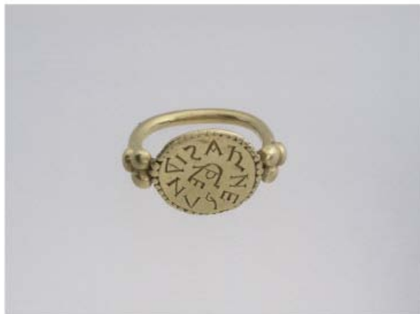
Figure 9: the ring of Aregund

As well as the belts, brooches and pins, Aregund was fitted with various other items of gold and silver. The ring which permits us to identify her is made of gold and has a monogramme inscribed on it which, when deciphered reads “AREGVNDIS REGINE”, Queen Aregund. 193 Her earrings were also made of gold and decorated with two large pearls. Two further decorative pins, made of gold and silver and measuring 26 cm, were used as decorations on her dress. 194