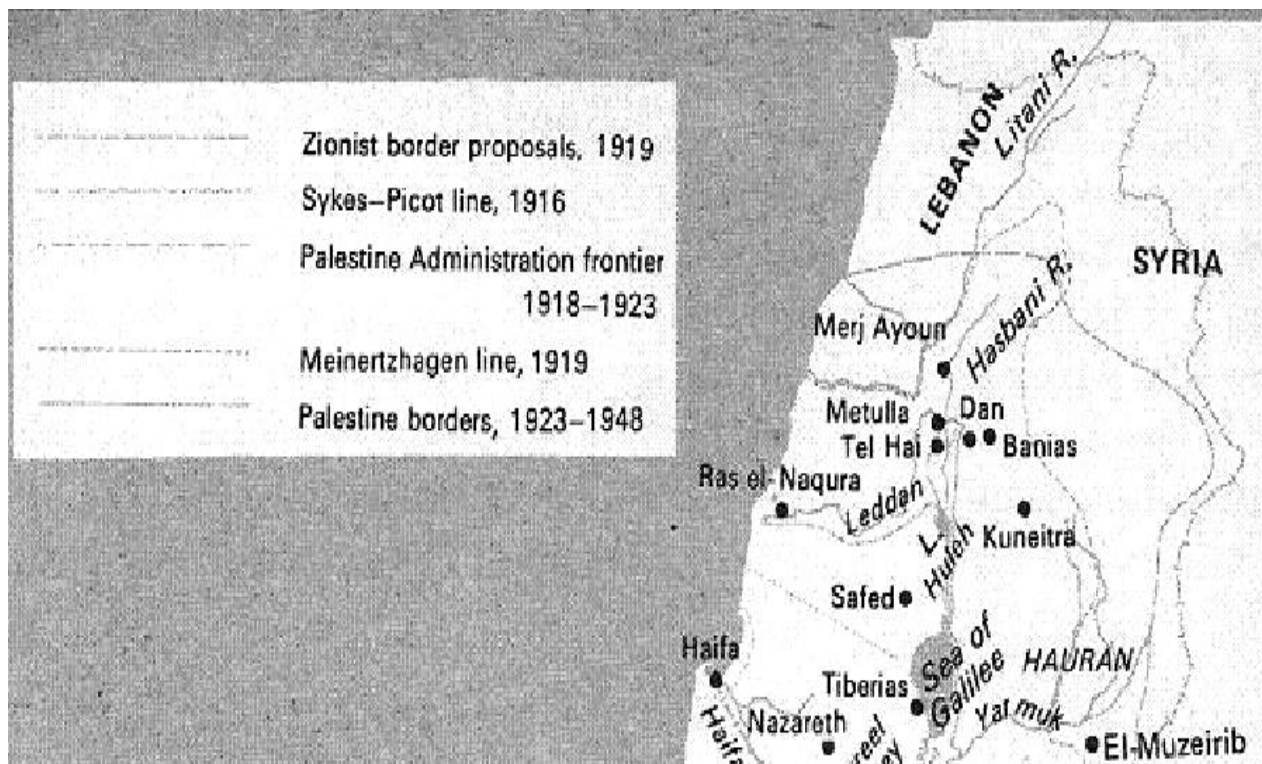
The Border Proposals 49