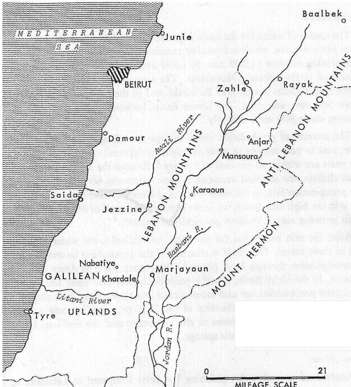
The Litani River 14