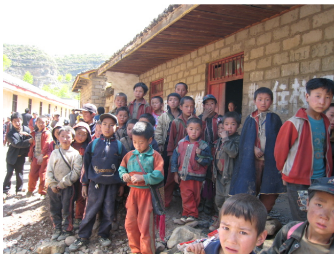
The Yi pupils in one primary school in the countryside of Zhaojue (Taken by Hu Xiaoqin).

middle schools which only have junior department in the countryside. Unlike Xincheng Town, in the countryside, several towns belonging to one administrative area are sharing one middle school. Indeed, the establishment of one middle school in every administrative area was a new achievement in September 2005. However, even now, there is no senior middle school in the countryside of Zhaojue. At the lower level, there are hundreds of primary schools in Zhaojue. Almost every township in Zhaojue has its own central primary school except Xincheng Town which has two primary schools at the same scale and one nationality primary school which only enrolls students from the Grade Four. Furthermore, there are many primary schools at the village level. In my thesis, I will focus on the primary school and junior middle school which constitute the nine-year compulsory education according to Chinese Compulsory Education Law. In Zhaojue, only a very few of Yi students can go to study in the senior middle school 50 , so the primary school and junior middle school enroll the majority of the Yi children especially the primary school.