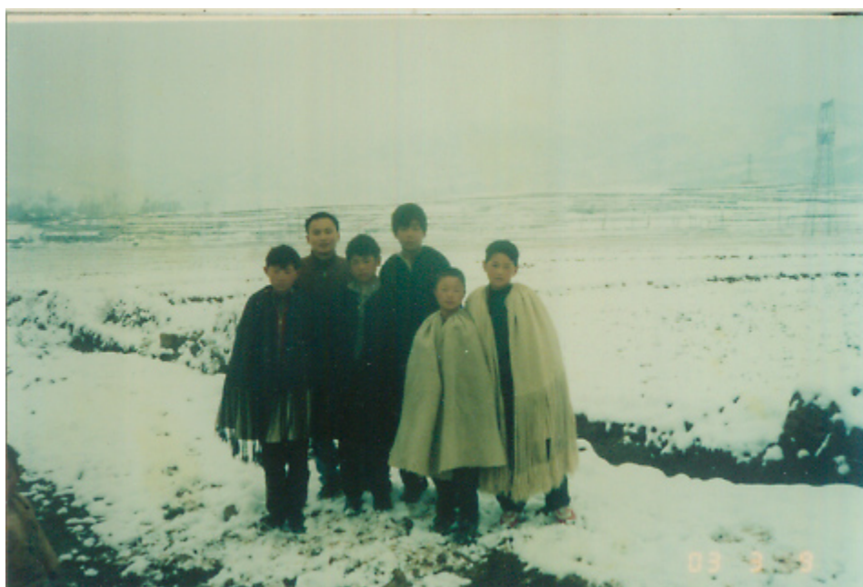
The Yi pupils and I on the way to Zhuhe Central Primary School, December 2002

But in Zhaojue, more than 97% of its population is Yi people. So Zhaojue can be regarded as a pure Yi community especially in the countryside since most of the Han migrations in Zhaojue are living in the Xincheng Town where the government of Zhaojue County locates. Secondly, Zhaojue has been regarded as the centre of history and culture for Liangshan Yi derive from the ancient time. 11 Zhaojue County was the capital of Liangshan Yi autonomous prefecture. There are three dialects of Yi living in Zhaojue, Yiluo, Shiza and Suodi respectively. Finally, I have been a volunteer teacher in Zhuhe Central Primary School in the countryside of Zhaojue from September 2002 to June 2003. The experience has given me the chance to observe the practice of education in Zhaojue and be involved into it. Additionally, my study can benefit from my wife's seven-year teaching experience and our contacts in local community in Zhaojue.