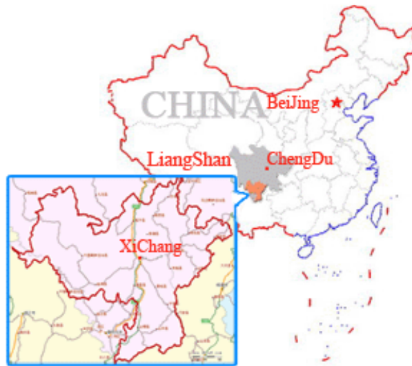
Liangshan in China